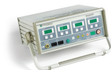
EnligHTN RF Ablation Generator