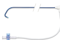
EnligHTN Guiding Catheter