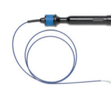
EnligHTN Renal Artery Ablation Catheter